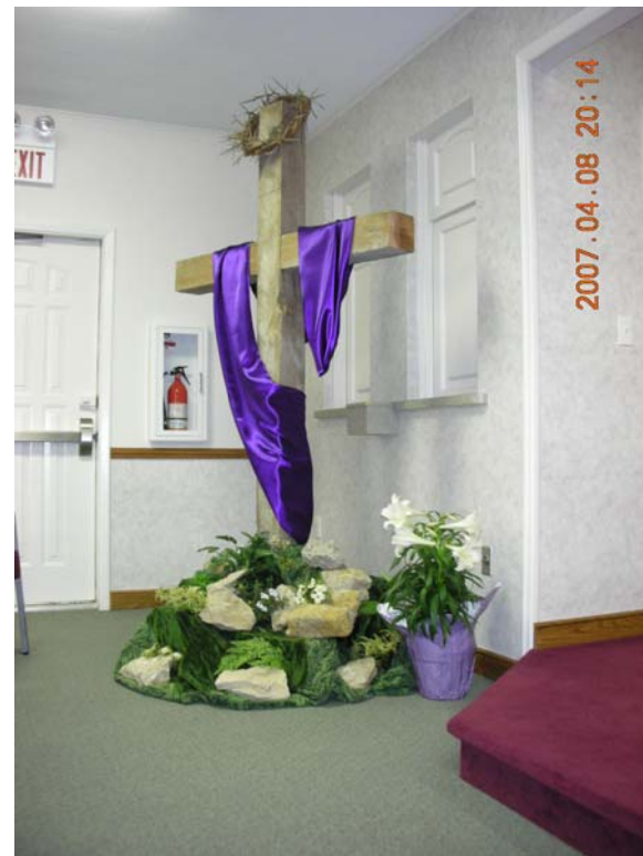
Cross display at the Mission