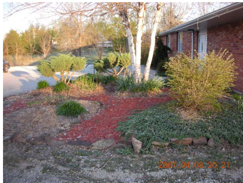
New outdoor landscaping at the Mission!

(From the Gathering and Greeting Committee: The Oak Grove branch is thrilled that the Mission is doing so well, and we continue our prayerful support for all the wonderful efforts of our brothers and sisters in Christ.)