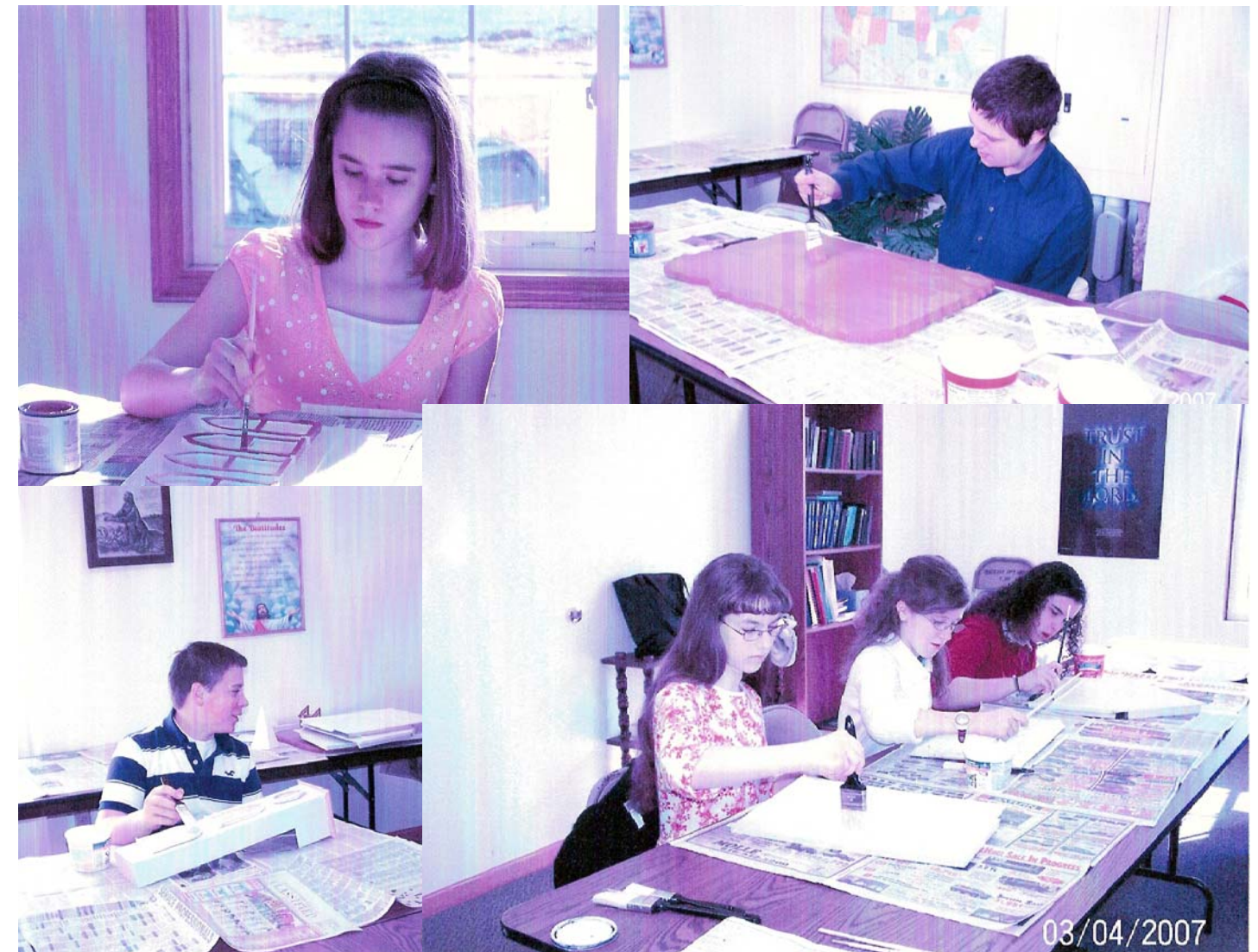
Recent snapshots of the class working on the Church model project

Our class is currently in the process of painting a very nice model of Christ's church as he designed it. Every Sunday we have fun (whether it is trying to get paint off our hands or learning the origin of the word holiday), but we also learn about Christ and his church. If you are in Junior High and would like to learn more about God, please come and bring your Scriptures.